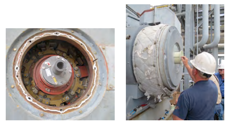
Figure 3 – Installations of EFREM on GE 7A6 units