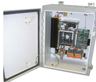
AT 7000 Receiver providing individual analog signal and/or RS-232, Ethernet outputs