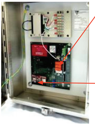
Receiver in NEMA 4 Enclosure