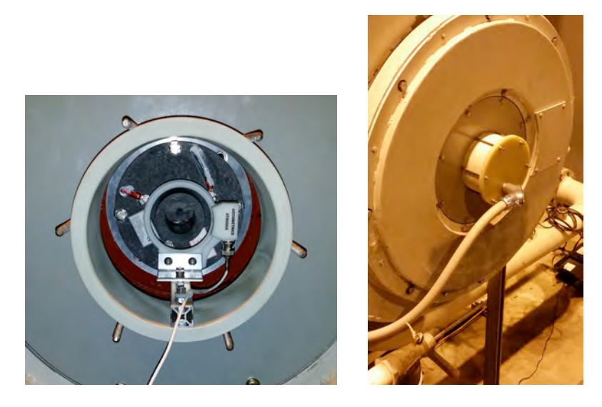
Figure 4 – Installations of EFREM on GE 9A4 units

On other types of generators, where Accumetrics does not have prepared installation kits, a site visit by an Accumetrics Field Engineer is generally recommended to make necessary inspections and measurements. This usually only takes a few hours and is typically done during an outage, when full access to the machine is available. Accumetrics will then make an offer to the utility for a customized mounting kit and any design changes that are necessary to install the EFREM on the intended generator. Although these customized installations take a little more time, they are still cost effective means of upgrading generators to a modern field ground detector.