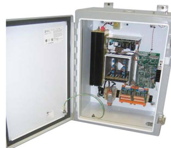
AT 7000 Receiver providing individual analog signal and/or RS-232, Ethernet outputs