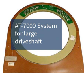
Stationary pickup/induction loop shown around a large transmitter collar