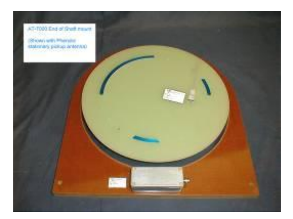
End of Shaft <u>AT-7000</u> system for monitoring 16 Strain Gages and 24 thermocouples (on a different generator) The AT-7000 multichannel system can measure RTD's, Thermocouples, Strain Gages, Pressure transducers, as well as differential Voltages (and Current shunts).

The <u>EFREM</u> Earth Fault Resistance Monitor system can measure and trend ground fault resistance (isolated field winding to rotor ground), field voltage, and alarm if thresholds are exceeded. Contact us to request information on this system, or look further at our <u>Products section</u>.