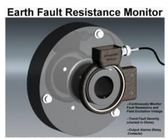
EFREM-- Rotor Predictive Maintenance