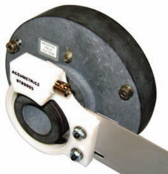
End of shaft EFREM